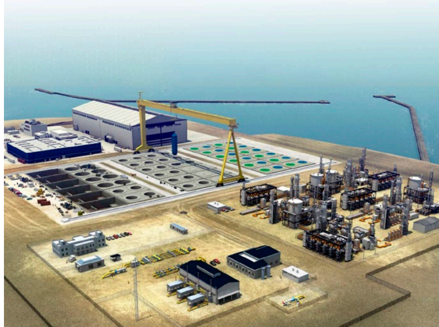
Fig. 2. Hydrogen gigafactory with factory in back, reactor field in the middle, and hydrogen plant in the front.

The gigafactory is made possible by the characteristics of hydrogen/synfuel. The energy output of such a facility would be similar to a large integrated oil refinery. In this context, there is a major difference between the capabilities of large electricity transmission systems and large pipeline systems and their associated storage facilities. Large electricity transmission lines have capacities of 1 to 3 gigawatts and essentially no storage. Pipelines have transmission capacities measured in tens of gigawatts. Hydrogen and synfuels, like natural gas and liquid products, can be stored in underground facilities. Those facilities today store a 30-day supply of natural gas. It is the ability to produce and store hydrogen at scale and transport it to a wide customer base that makes large, centralized facilities like the gigafactory a technical and economically viable option. Synfuels enable even longer-range tanker transport and sales to the global market.