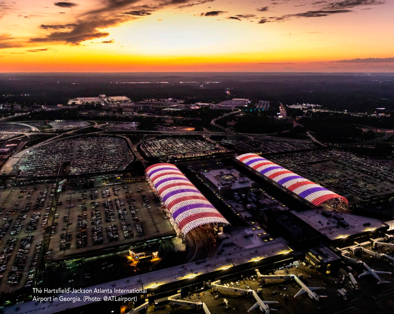
The Hartsfield-Jackson Atlanta International Airport in Georgia.

The nearest nonnuclear analogy to a nuclear technology hub can be found in some airports, such as the Hartsfield-Jackson Atlanta International Airport, Mojave Air and Space Port, and Charleston International Airport. Each of these airports has commercial air flights but also other activities that share taxiways, security, and many other services on public and private land. Atlanta has the massive Delta Airlines operations, aircraft maintenance, and training facilities. Charleston is a joint civilian military airport that includes a Boeing commercial aircraft manufacturing plant and other facilities. Mojave has commercial flight testing, space industry development, heavy aircraft maintenance, and commercial aircraft storage.